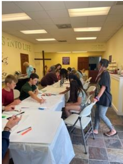
Northstar Youth working on our Angel Tree Christmas Program art work