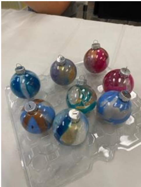
Christmas bulbs made by some Northstar Youth